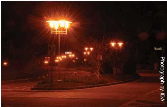
Glaring lights can actually reduce visibility. Here the brightest most visible objects in the area are the lighting fixtures, not the roadways, walkways or parking areas which a driver or pedestrian would expect to be lighted. Atlanta, Georgia.

must travel farther from home for a clear view of the skies. Increasingly, the most important equipment needed to enjoy the wonders of the night sky is an automobile with a full tank of gas and a map.