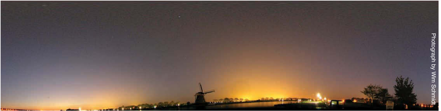
Sky glow over the Netherlands