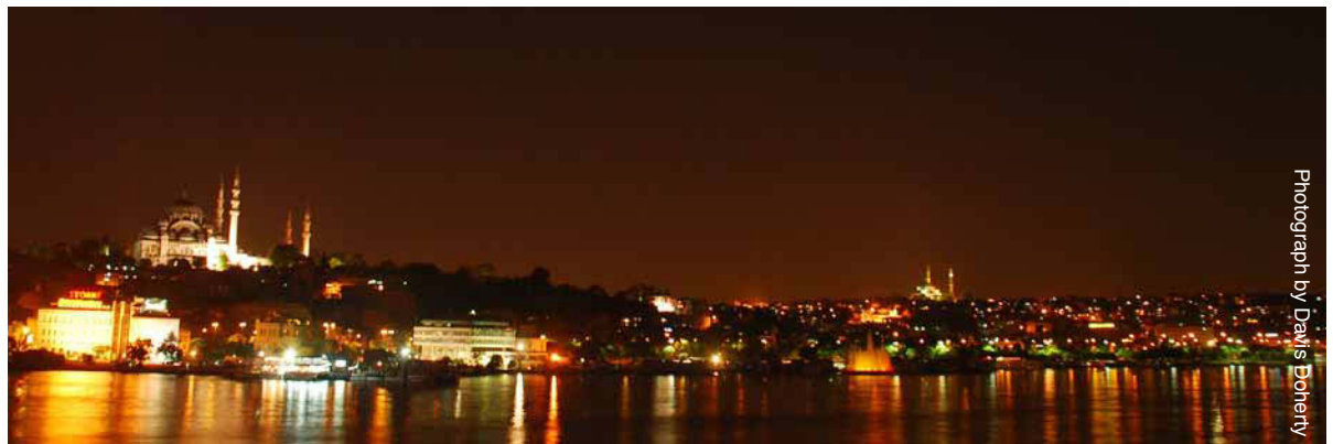
Sky glow over Istanbul, Turkey.